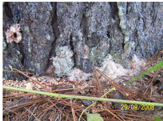
Ambrosia beetle boring dust at base of tree.