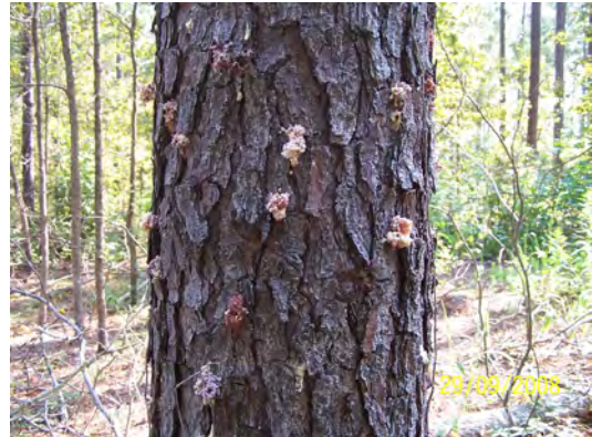
Black Turpentine Beetle pitch tubes on heavily infested pine.

Ambrosia Beetle damage can be quickly identified by the fine, flour-like boring dust at the base of the tree. When the boring dust is