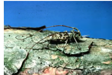
Pine Sawyer adult beetle.

The Southern Pine Sawyer Beetles are large beetles, often 1-1 1/2 inches in length, with antennae that are longer than their bodies. Pine Sawyers attack recently killed pines and, in forested situations, should be considered beneficial insects as they hasten the decomposition of dead trees.