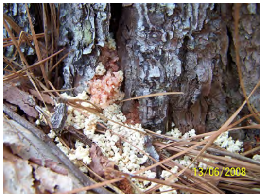
Black Turpentine pitch tube and characteristic boring particles at base of tree.